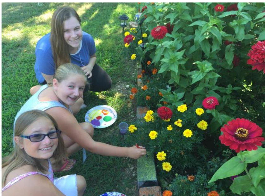
Campers in the Grove decorate the new Butterfly & Hummingbird Garden

“Beautiful energy, vibrant, nurturing, peaceful – perfectly suited to a meditation retreat. Thank you!”