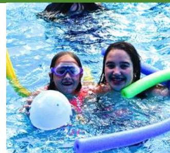
Camping in the Grove—July 2015