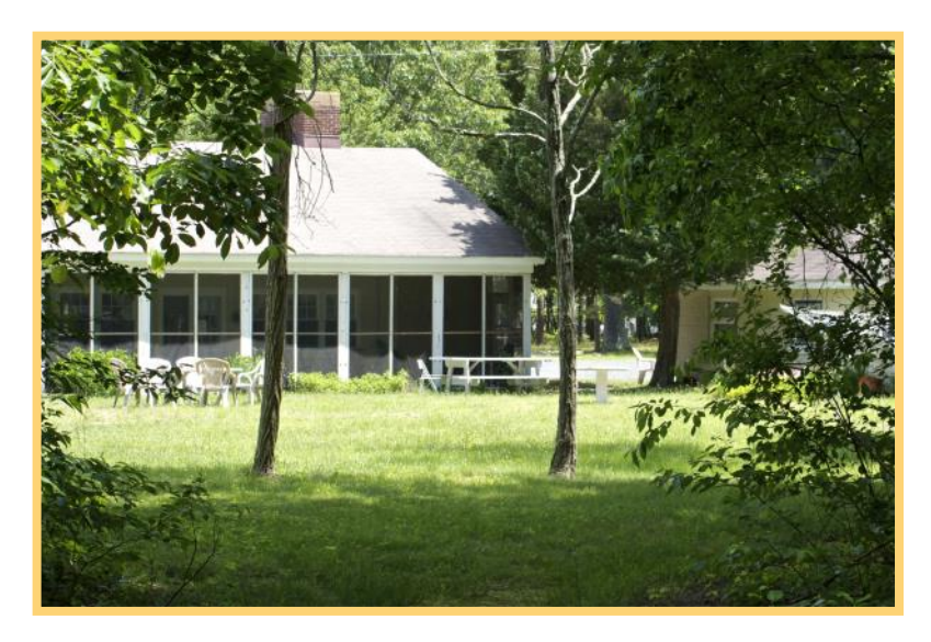
A Natural Setting for Hope, Transformation, Service, and Fun!