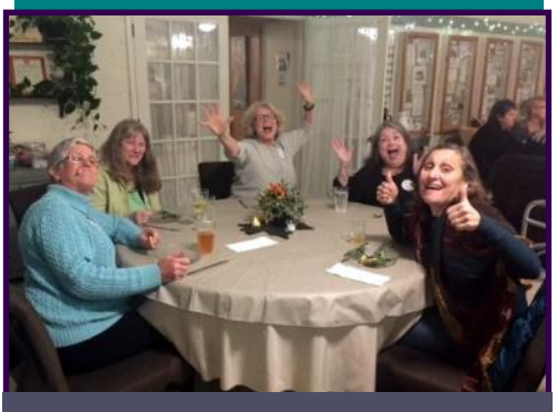
Fun at our Annual Women's Retreat

*If it is more convenient for you, Murray Grove can follow your instructions for sustaining gifts using the credit card information you provide.